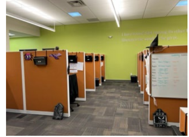
Three Square Food Bank – Call Center