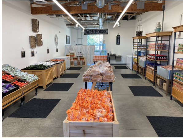
Catholic Charities of Northern Nevada – Client Choice Pantry