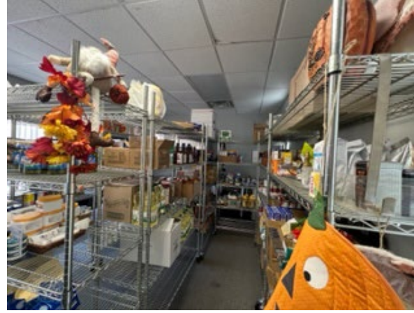
Desert Springs Community Resource Center