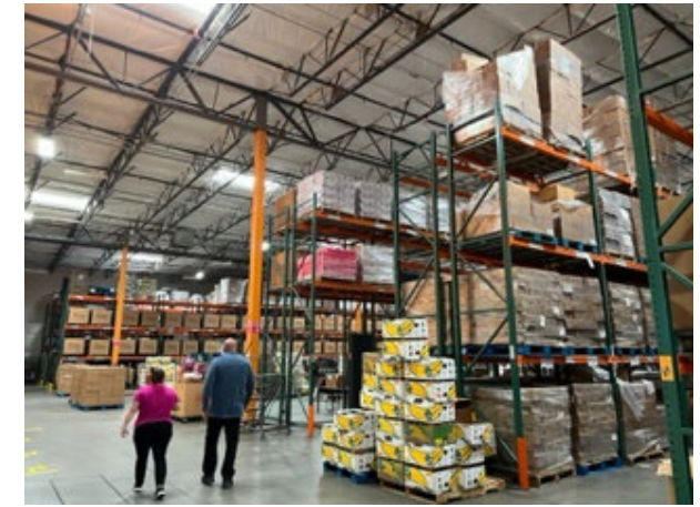
Three Square Food Bank