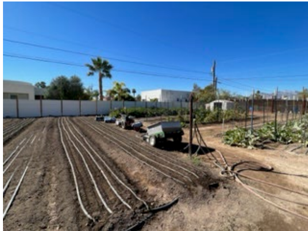
Dignity Health – St. Rose Dominican – Cluck It Farm