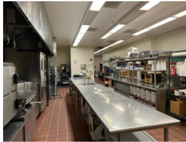
NyE Communities Coalition